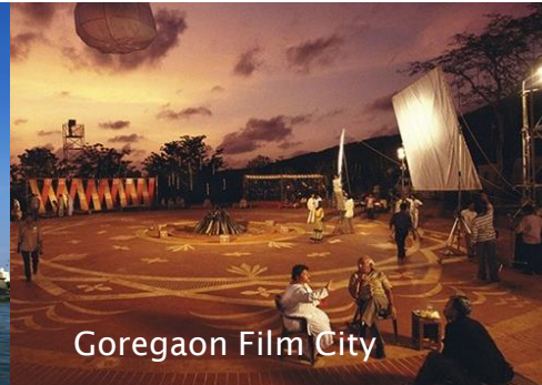
Goregaon Film City