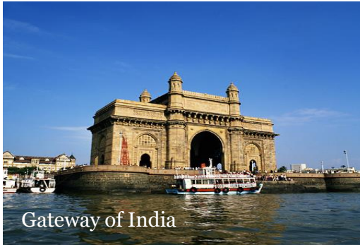
Gateway of India