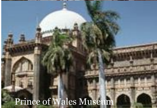
Prince of Wales Museum