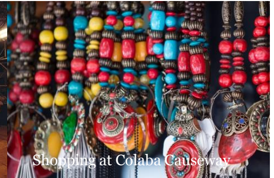
Shopping at Colaba Causeway