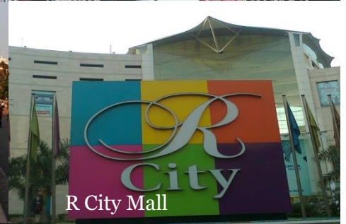
R City Mall