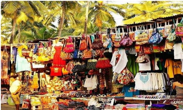
Anjuna Flea Market